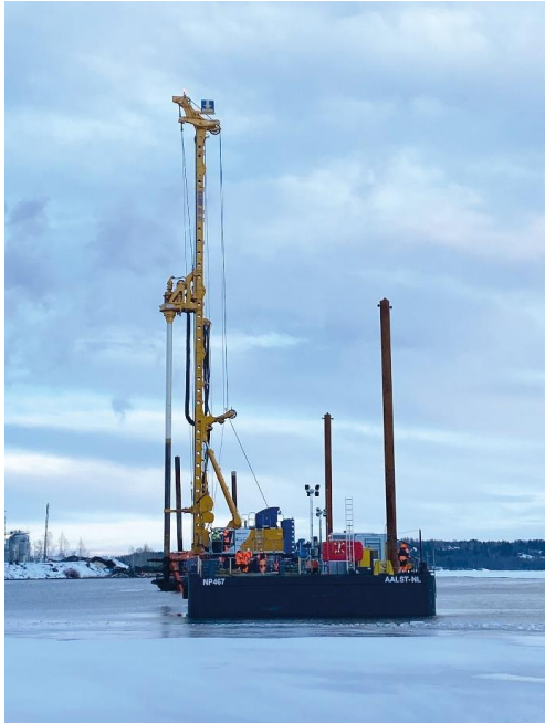
(1) The BAUER BG 45 drill rig works in nearshore conditions on a barge.