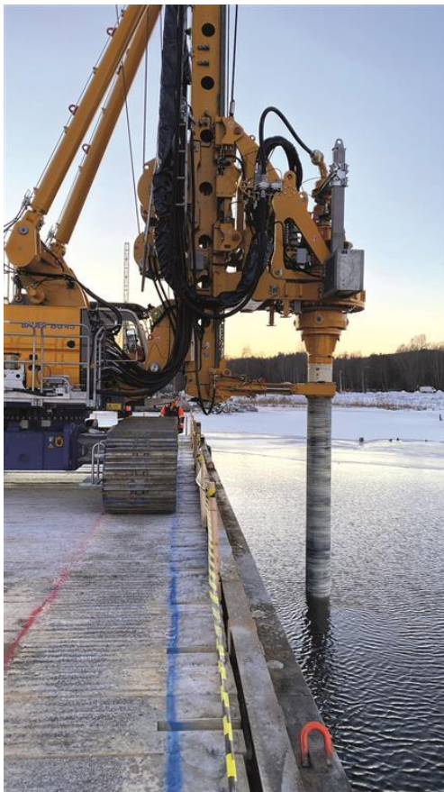
(2) The water depth is up to 8 m.